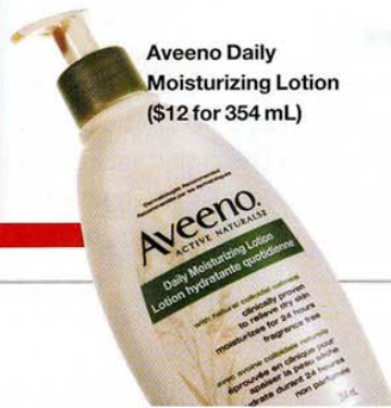
Aveeno Daily Moisturizing Lotion ($12 for 354 mL)

6 BODY LOTIONS $ “Go for a light lotion—preferably one that’s fragrance-free and hypoallergenic if you have sensitive skin,” says Gidon. Look for brands with vitamin E and colloidal oatmeal, but, again, avoid products with mineral oils; they can lead to breakouts.