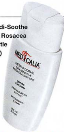
Medicalia Medi-Soothe Dry-Sensitive Rosacea Skin Line Gentle Cleanser ($38)