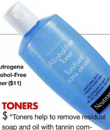
Neutrogena Alcohol-Free Toner ($11)

2 TONERS $ “Toners help to remove residual soap and oil with tannin compounds, like witch hazel,” says Weksberg. “But if you need a toner, it may be a sign that you’ve chosen the wrong cleanser for your skin type. Also, it’s a popular misconception that toners close pores—no product will do this.”