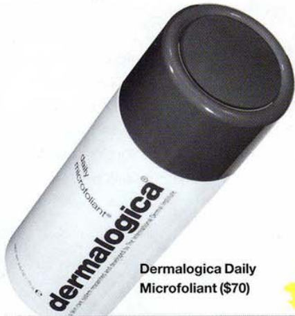
Dermalogica Daily Microfoliant ($70)

“FOR THE BEST RESULTS, KNOW YOUR SKIN TYPE BEFORE YOU PURCHASE ANY CLEANSER OR MOISTURIZER.”